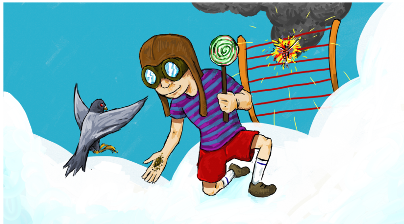
Figure 9: Concept art for the game.

challenging game-play with inter-level bonuses, power-ups, etc. We also have some sounds in the data folder that we did not integrate in the game because of the lack of time.