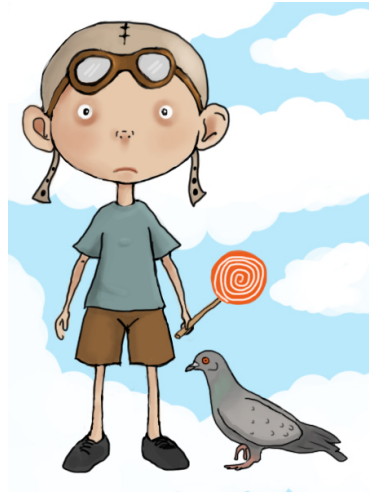
Figure 8: Concept art for the game.