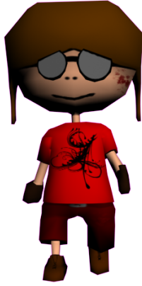
Figure 3: Rendering sample of the boy.