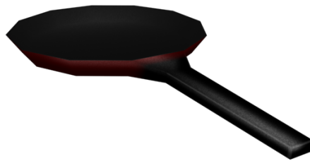
Figure 5: Rendering sample of the pan.