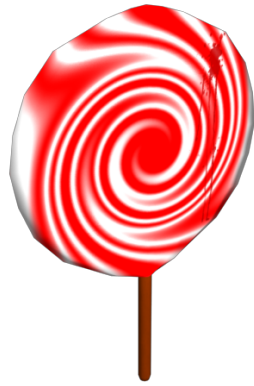
Figure 4: Rendering sample of the lollipop.